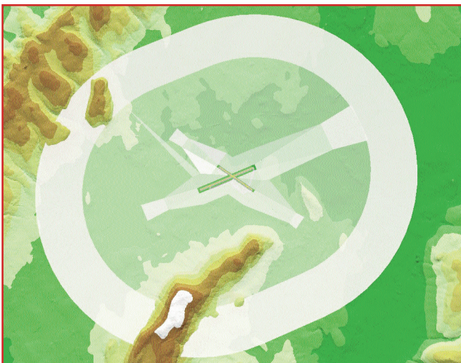
Part 77 Protected Surfaces