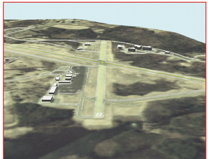
3D Draped Model of Airport